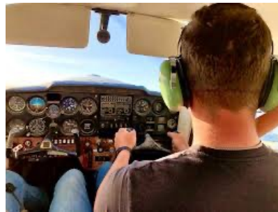
CFI Study Group on FaceBook