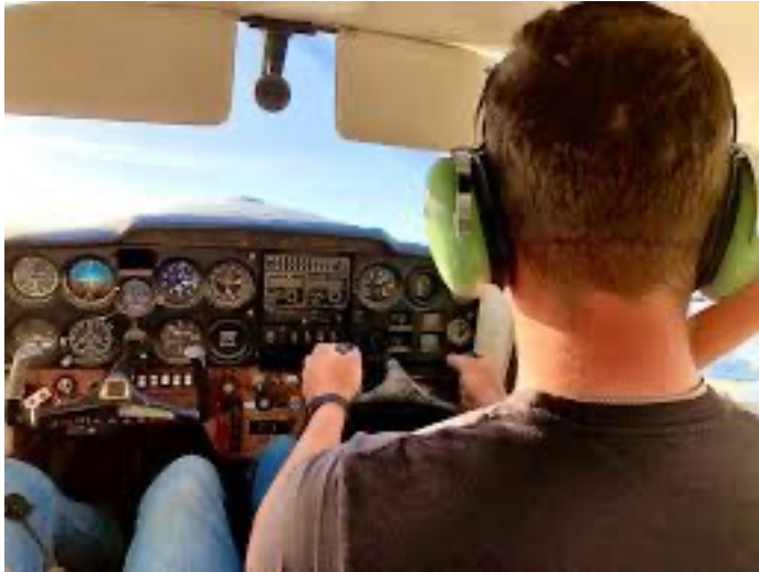
CFI Study Group on FaceBook

Join SAFE and the Facebook CFI Study Group by Clicking on the Images Above